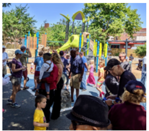
Figure 3. Addressing housing affordability issues is essential if everyone in our community is to thrive, both young and old.

announcement, residential rents began increasing significantly – our community immediately heard from friends and neighbors about across-the-board leasing hikes, shorter lease terms, and costly maintenance upgrades in the high-density residences. Likewise, older residents on fixed incomes,