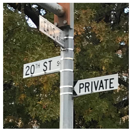
Figure 8. Private superblocks create barriers to walkability.

Metrorail, various bus systems, and VRE connect the 22202 community with D.C. and with other parts of northern Virginia, but improvements are especially needed to increase capacity and