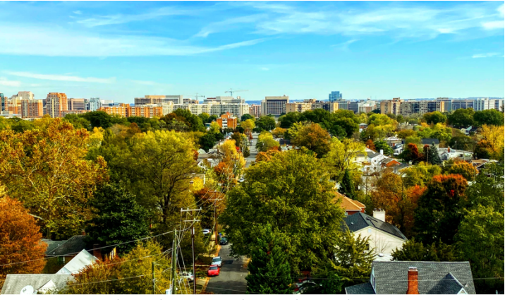
301,000<sup>2</sup>. However, that growth will be Figure 2. Residents live in single family residences, concentrated in the Route 1 corridor and townhouses, condominiums and apartments across the area.

Even before Amazon's announcement, Arlington's population was projected to grow by 26% over the next 25 years, to 301,000<sup>2</sup>. However, that growth will be concentrated in the Route 1 corridor and the adjacent Columbia Pike corridor,