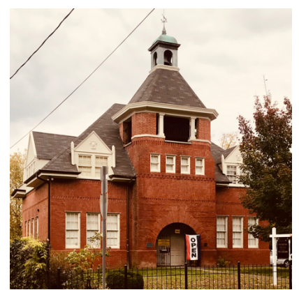
Figure 7. The Hume School, dating to 1891, home to the Arlington County Historical Society.

spaces and selective programming to encourage the organic creation of community and to sustain existing relationships as residents move through their lives.