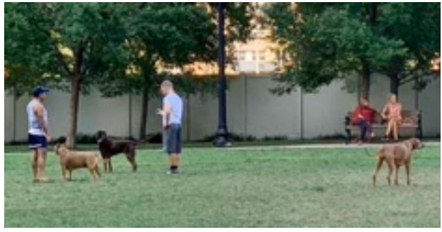
Figure 5. Dogs and people both benefit from social interaction. Our large dog population necessitates purpose-built dog facilities.

The 22202-area has long been underserved for open space and community facilities; the coming increase in population will exacerbate this problem. The community needs a public park that acts as a central space for socializing and holding community events, a need that is more critical as our apartment-intensive community increasingly uses public spaces for former "backyard" activities such as barbeques and birthday parties. The Aurora Hills community center building is centrally located but, with only one small room and one medium sized room, has insufficient space and services