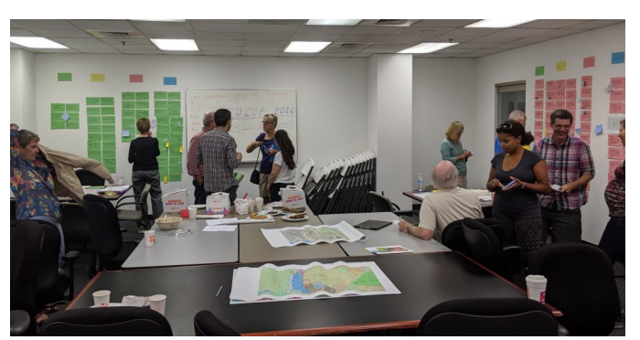
Figure 10. Livability22202 Workshop.

However, we think that many of these constraints can be mitigated through a sustained level of collaboration among the community, developers, property owners and organizations, and the county, that can work with and is supportive of formal county planning processes. From our experience developing this report, residents found it invaluable to have workshops run by expert facilitators with well-rounded planning and urban design experience. With no vested stake in the outcome, the