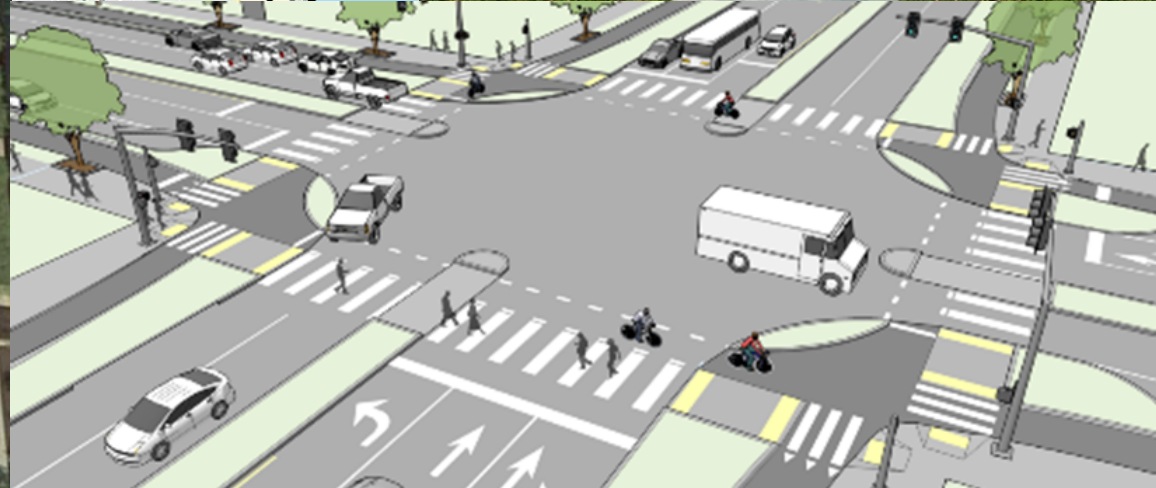
Left: Vast expanse of Hayes St rebuilt as an outdoor hub for all modes and people, and a true main boulevard. Top center: Connected network of biking facilities comfortable for all ages and abilities of riders, not just the fearless. Top left: Attractive direct biophilic walking connections to where people want & need to go. Cars optional. Above: Intersections, such as those along 15 th , rebuilt to minimize driver turning speeds and ped crossing length.